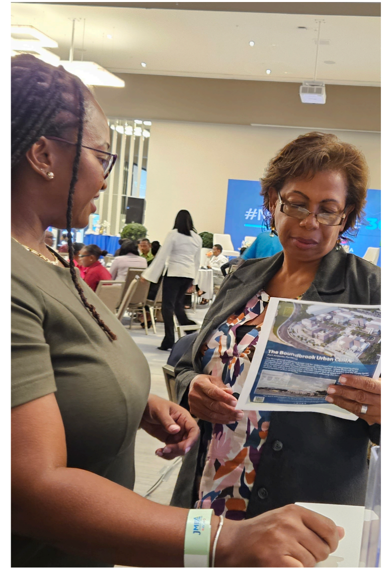
Team FCJ interacting with attendees.

As a sponsor of the conference, FCJ had a booth displaying our products and services with a focus on our major projects namely, Morant Bay Urban Centre, Naggo Head Integrated Business Centre, Boundbrook Urban Centre - Phase I, as well as our divestment properties. The Team spent the day engaging with attendees on the conference floor and visitors to our booth, some of whom were existing clients of FCJ.